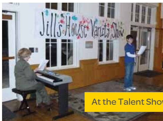
At the Talent Show

of his wheelchair, held him in his arms, and danced with him.